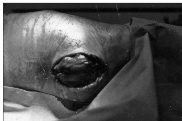
Figure 1. Medial approach to thigh decompression with bulging quadriceps and adductor muscles.

The author believes this patient's compartment syndrome was caused by a relative outflow obstruction of the venous system due to the catheterization and