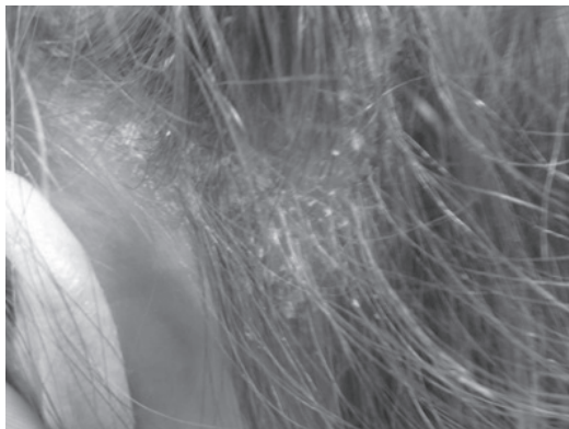
Figure 2. Erythematous Plaques

Poorly defined erythematous plaques with greasy scale, suggestive of seborrheic dermatitis, underlie the more thickly adherent scale.