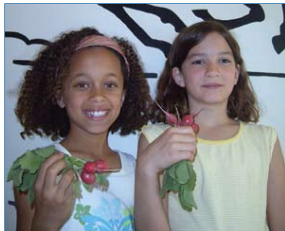
Students at Marquette Elementary School show off the first fruits of their labor made possible by a grant from the Foundation supporting nutrition education through a Junior Master Gardener Program.

Did you know... You may nominate a young physician from your area and spread the word on other opportunities? The Foundation offers many scholarships and awards primarily to medical students, but also to students in other health careers identified as