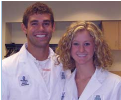
Students at the Medical College of Wisconsin pose after receiving their white coats.

We are pleased to provide this report on our programs and support for medical education and health initiatives in 2009. These awards are made possible by annual donations from people like you, by those who attend or donate to support our annual fundraising event, and by generous physicians and grateful patients who have chosen to give back by establishing funds and endowments that provide enduring support.