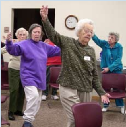
2008 grant recipient: Falls Prevention Safe Communities, Dane County